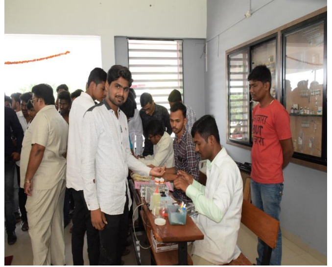
Event Name: Blood Donation and Health Check-up