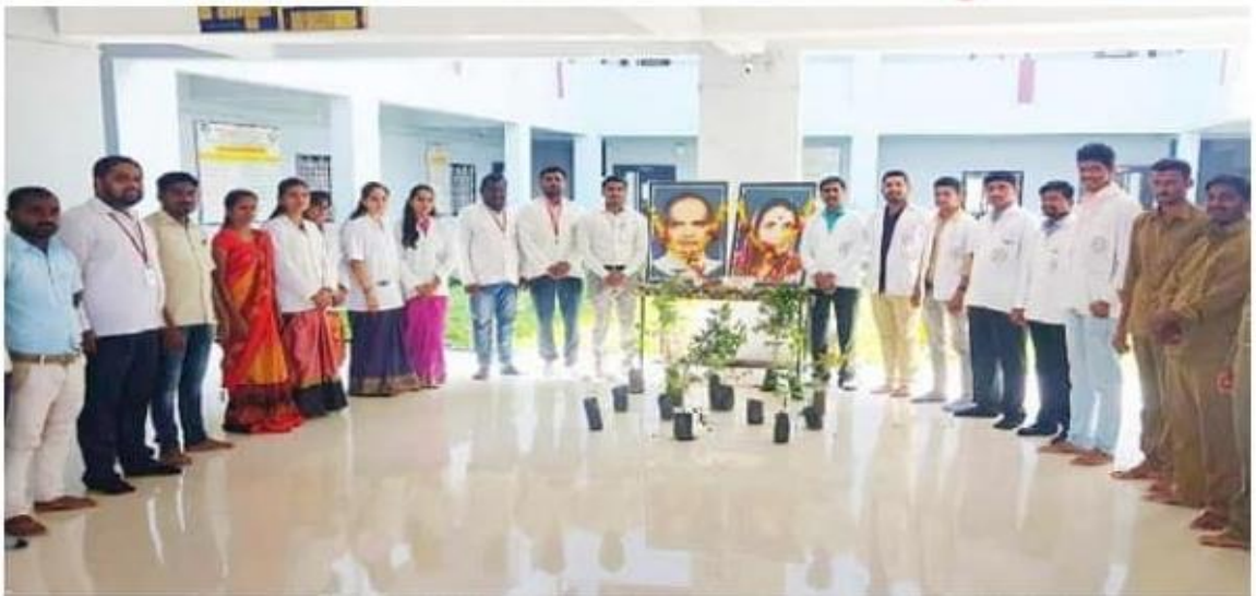
Event Name: Tree Plantation