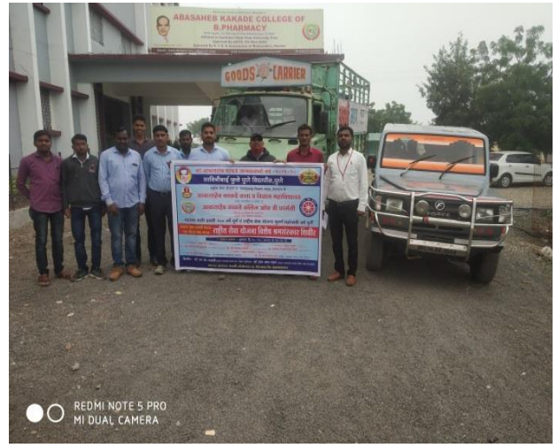
Event Name: Shramdan (NSS) Date:18/12/2019