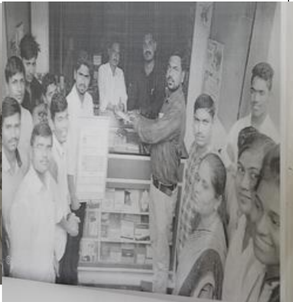
Event Name: World Pharmacist Day(Felicitation of Pharmacist at Bodhegaon) Date:25/09/2019