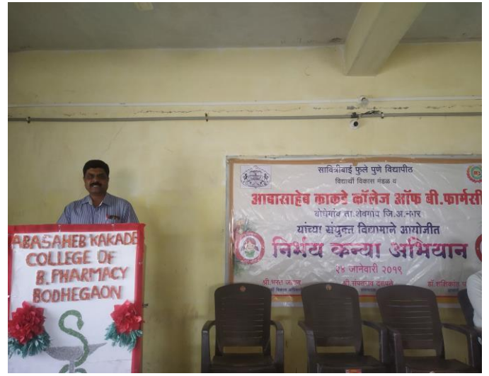
Event Name: Nirbhay kanya Abhiyan