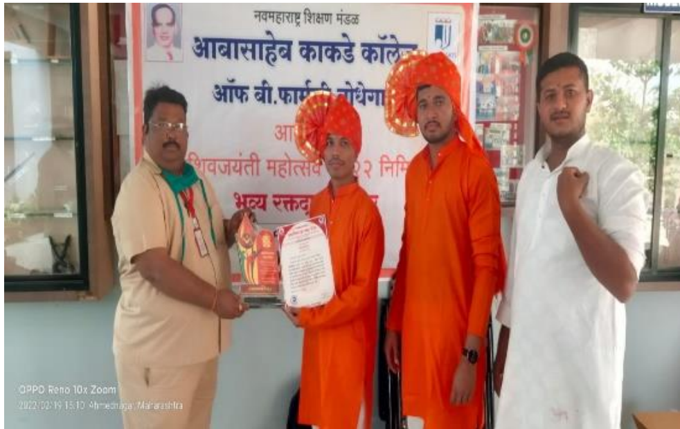
Event Name: Blood Donation Date: 19/2/2022