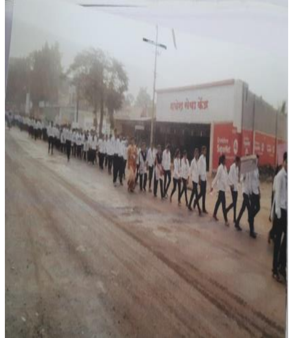
Event Name: Kanya Ratna Awareness