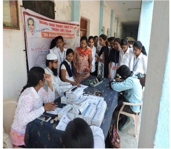
Event Name: Heamoglobin Detection Camp