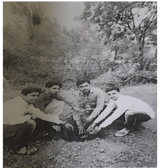
Event Name: Earn and Learn