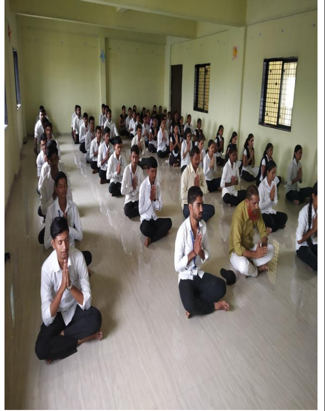
Event Name: International Yoga Day & Speech